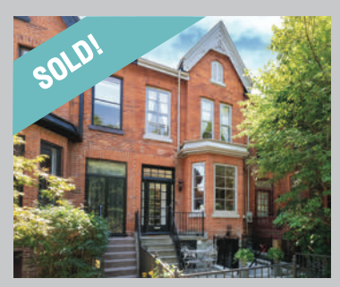
409 Carlton Street Cabbagetown