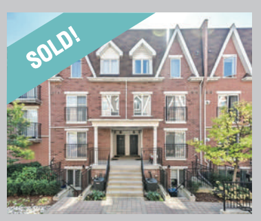
10 Laidlaw St #712 King West