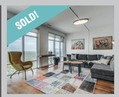
2191 Yonge St #4901 Yonge & Eglinton