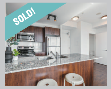
55 East Liberty St #713 Liberty Village