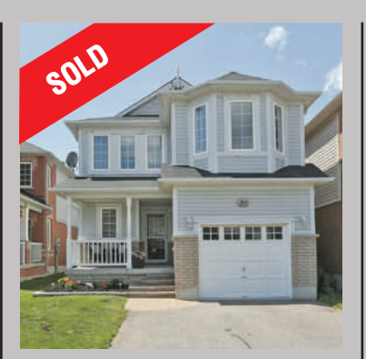
80 Bannister St BOWMANVILLE