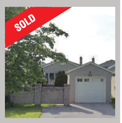
87 Comrie Ter SCARBOROUGH