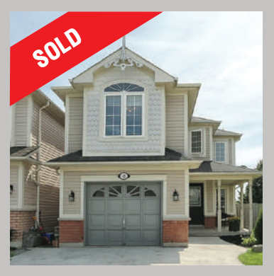
45 Bannister St BOWMANVILLE