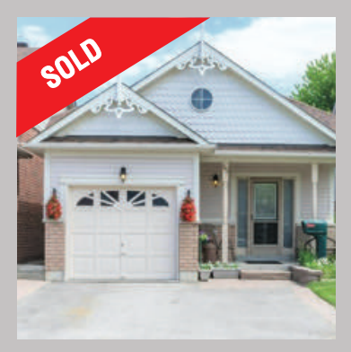
55 Millburn Ave BOWMANVILLE