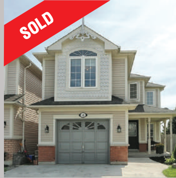
45 Bannister St BOWMANVILLE