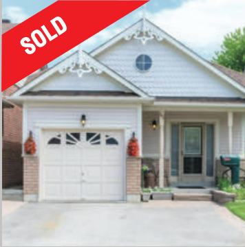
55 Millburn Ave BOWMANVILLE