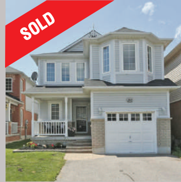
80 Bannister St BOWMANVILLE