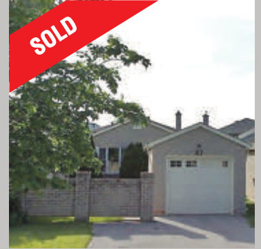
87 Comrie Ter SCARBOROUGH